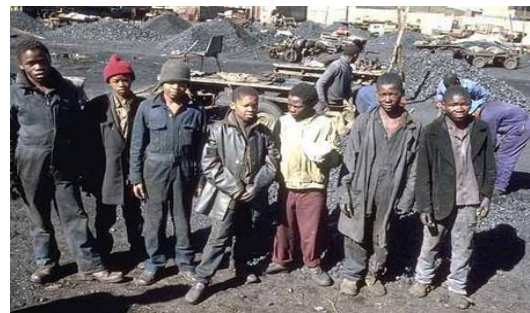
Republic of South Africa